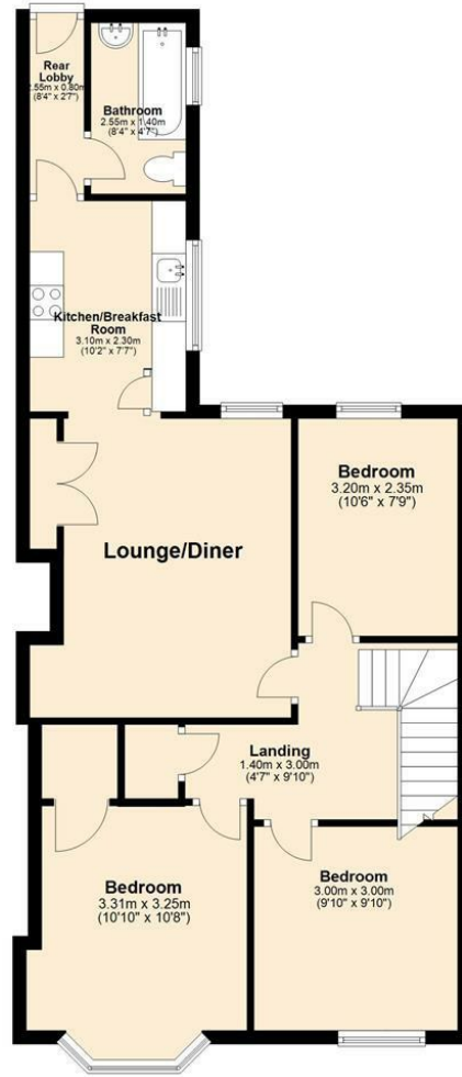
First Floor Approx. 69.2 sq. metres (744.5 sq. feet)